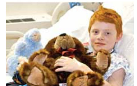
Donated bears cheer pediatric patient